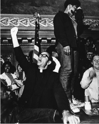
Father James Groppi at the Wisconsin State Capitol during welfare demonstrations, 1969.